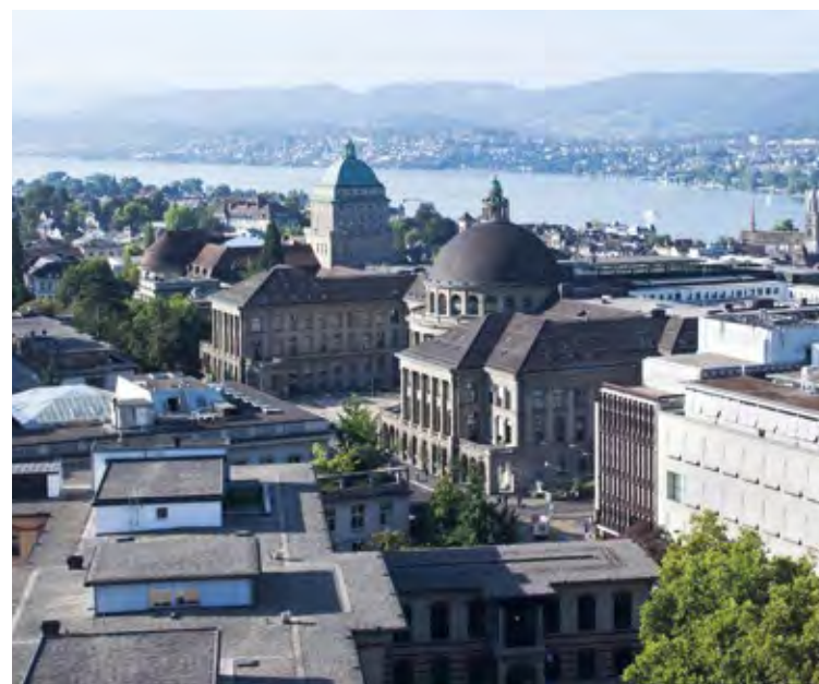
Swiss Federal Institute of Technology Zurich (ETH Zurich)

The business location Greater Zurich Area offers a unique network of innovative companies and internationally renowned research and teaching institutions as well as an extremely powerful and reliable data and communication infrastructure providing major business location advantages for your enterprise.